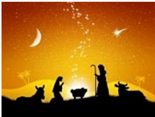
O Holy Night