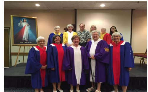
Ct. Wenatchee #255