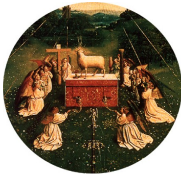
The Feast of the Body and Blood of Christ—Corpus Christi